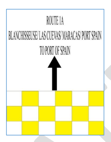
Figure 1 below shows the proposed Route 1A Checkered Band Maxi-Taxi Stop Sign

It should be noted that the preliminary feedback received from the Route 1 Maxi-Taxi Association – Yellow Band by letter dated October 3<sup>rd</sup>, 2022 indicated that the Association is in favour of the proposed Checkered Band Pilot Project and it considered the implications and proposed solution for the checkered band maxi-taxis operating on the main roads within the Route Area 1 en route from Port-of-Spain to Maracas.